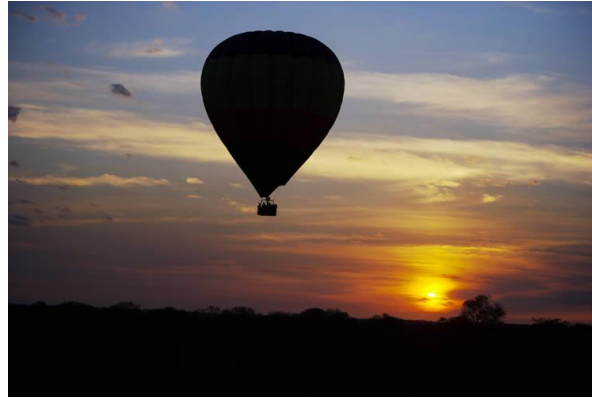
South africa: cape town and wildlife

Elephant Back Safari – get up close and personal with an African elephant and see Kapama Game Reserve from his back