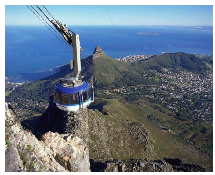
Day 3: Cape Town - Cape Winelands tour

Experience a tour of the famous Cape Winelands with its historic homesteads, sprawling vineyards and the quaint tree-lined village streets. Your tour begins with a drive to Paarl, offering historical charm, culture, architectural heritage, wine and fruit farms and breathtaking scenery. Continue along the Berg River valley to the picturesque town of Franschhoek have the opportunity of walking through the quaint village. Next stop is at the historic University town of Stellenbosch, the oldest town in the country after Cape Town and is one of the most scenic and historically-preserved towns in southern Africa. During the course of the day there will be ample opportunity to taste some of the magnificent wines produced in this region and also to enjoy lunch (which is on your own account). (B)