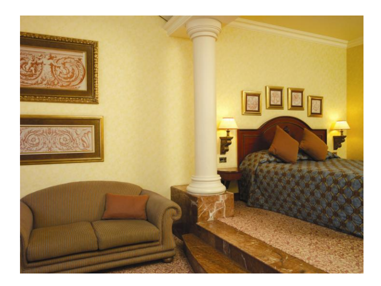
Day 9: Depart Johannesburg for USA

Full day at leisure to participate in optional excursions. later to Johannesburg airport for your flight home or you may opt for a safari extension to Botswana - <u>4 nights Okavango Delta Safari</u> or an extension to Victoria Falls. (B)