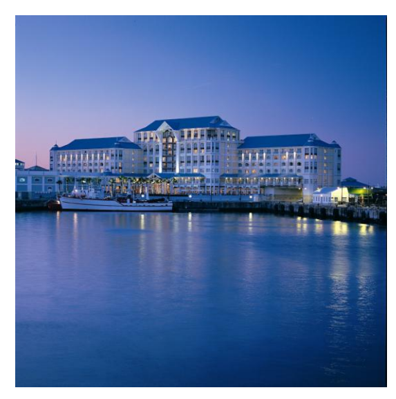
Day 2: Cape Town - City tour

Enjoy a guided tour of the City. The tour gives you the opportunity to discover the spirit of the Mother City, experience her vibrant cultures and history and enjoy botanical scenery. Visit the City center, the Company Gardens, the Castle of Good Hope and the Malay quarters. Weather permitting take Table Mountain by cable car to view the city underneath (the cost of the cable car ticket is not included as the excursion is weather dependant). Your last stop is at the vibrant Victoria & Alfred Waterfront where you may choose to return to the hotel or stay to explore the bustling shops and restaurants. With more than 300 specialty stores, craft markets and 70 eateries, the V&A Waterfront opens a world of opportunities to shoppers and diners alike. (B)